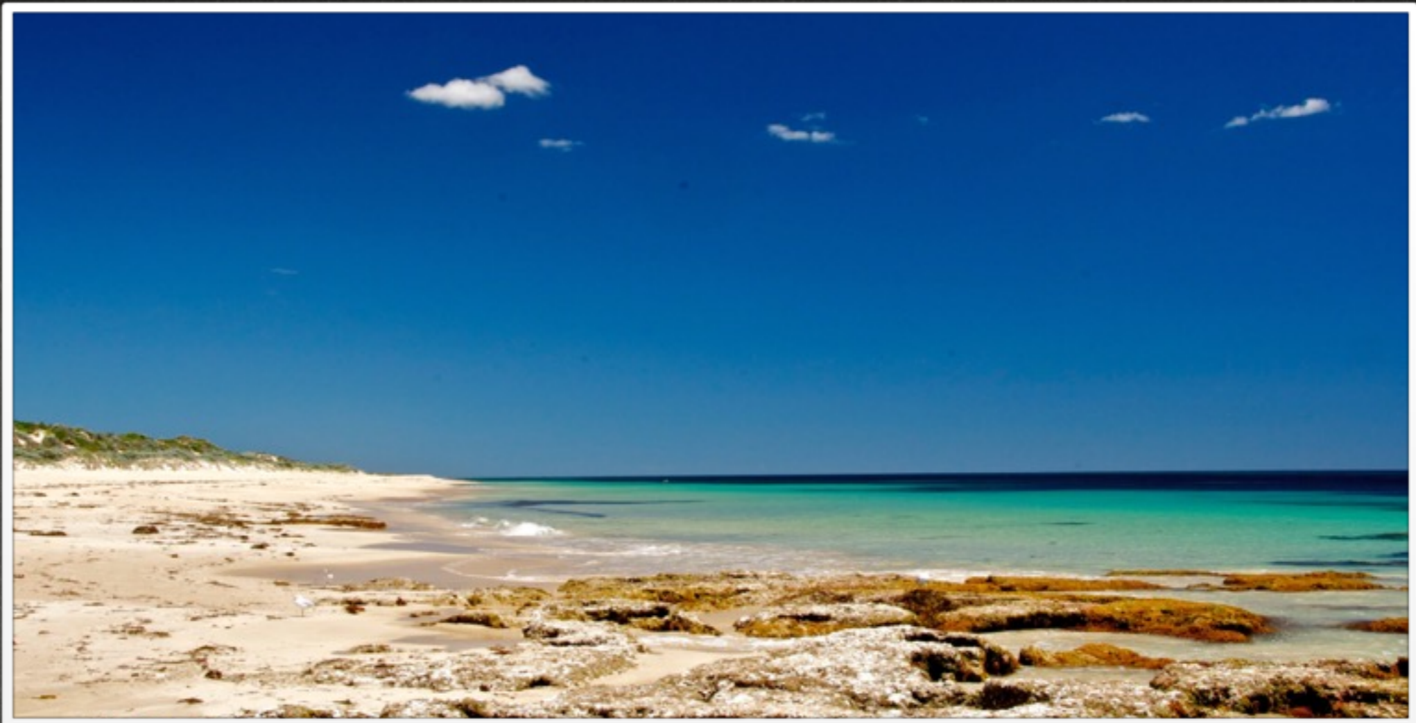
Florida Beach Dawesville